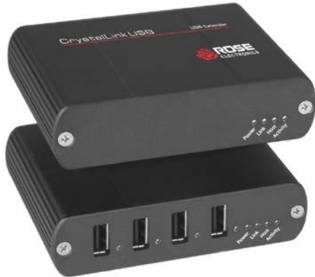
Part Number CLK-4U2TP-100M