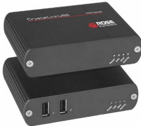
Part Number CLK-2U2TP-100M