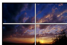
Display a video source across four displays

UltraVista SX maintains the original resolution quality of the input image on all monitors, producing a crisp, clear, perfect image.