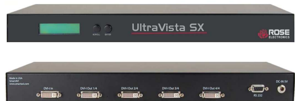
Front / Rear view

■ Phone: 281-933-7673 ■ E-mail: sales@rose.com ■