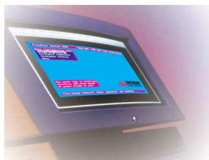
UltraView Remote on-screen menu