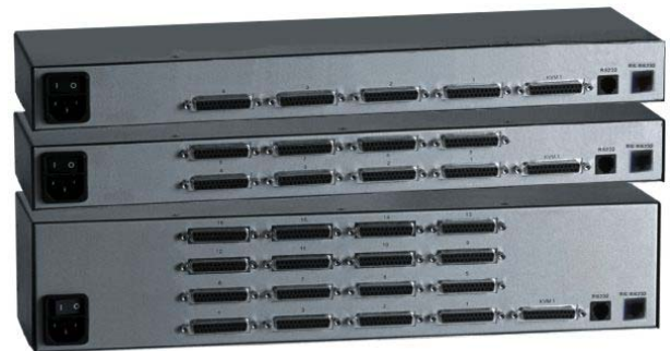
Rear view of UltraView Remote

■ Phone: 281-933-7673 ■ E-mail: sales@rose.com ■