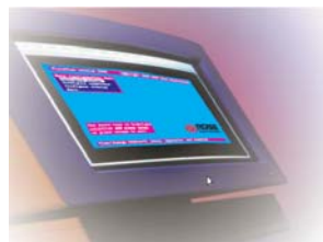
UltraView Remote on-screen menu

With its ability to access your computers and servers locally or over IP, its advanced on-screen menu system, built-in security, flash memory, easy expansion, and other features you start to get a sense of the advantages and applications that the UltraView Remote can provide..