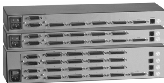
Rear view - UC1 1x4, 1x8, 1x16

■ Phone: 281-933-7673 ■ E-mail: sales@rose.com ■