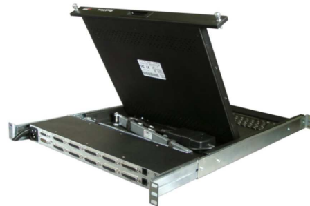
RackView with optional KVM switch

Environmental 32°F - 122°F (0° - 50° C), 20%-80% non-condensing RH