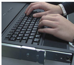
Easy access right at the rack

PC's, UNIX, Sun, and Apple computers can easily be accessed, monitored, and controlled locally using RackView.