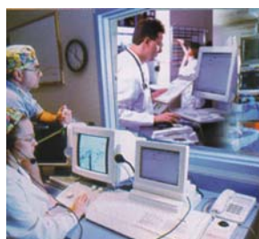
Medical or dental personnel access a computer from multiple locations

The MultiStation has a variety of other features to fine-tune your application. Call us to find out how the MultiStation can simplify your computer access.