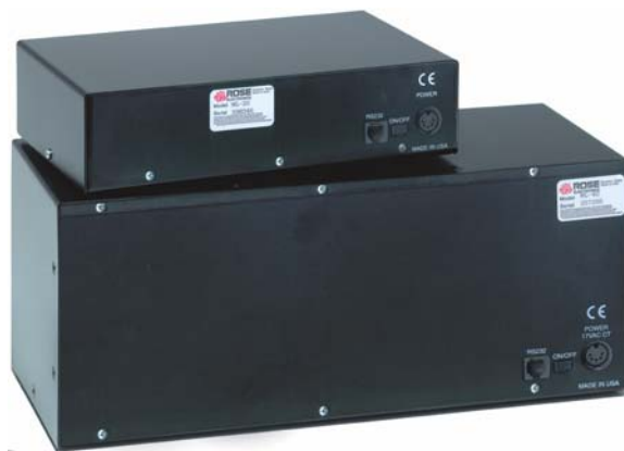
Rear view of MultiStation models ML-2U and ML-4U

■ Phone: 281-933-7673 ■ E-mail: sales@rose.com ■