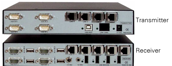
Rear view Quad Video Model

■ Phone: 281-933-7673 ■ E-mail: sales@rose.com ■